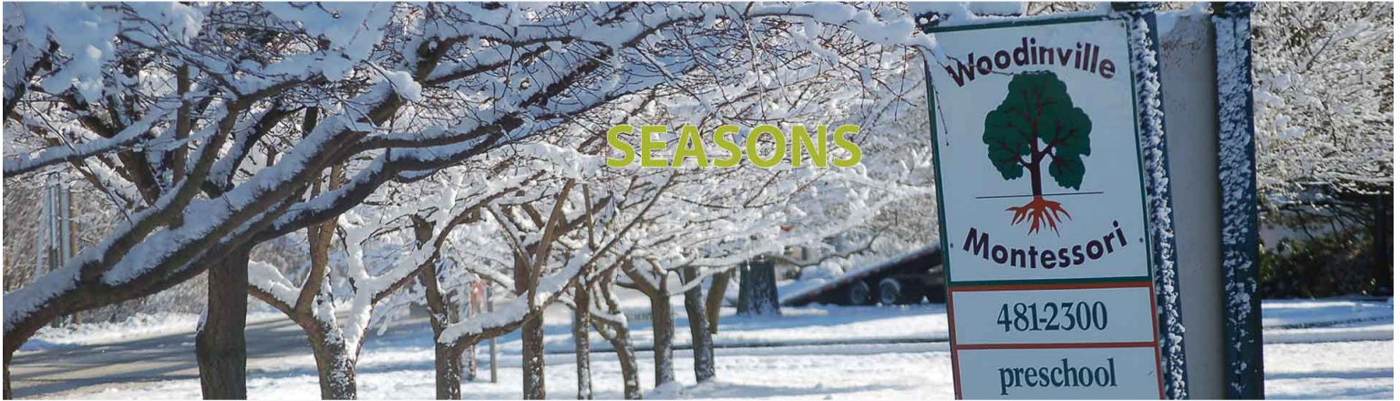
🏠 > Seasons, winter 2019