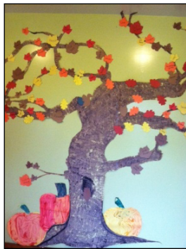
Tree of Thanks